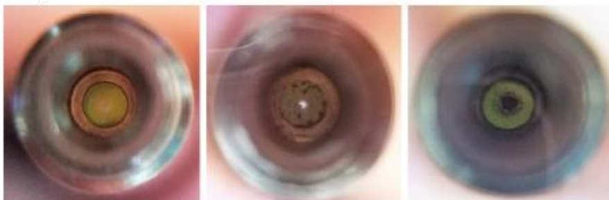
Good optical window: Clear and transparent

The optical window of the handpiece body is easily contaminated with dust, resulting in a drop of the laser output. We recommend checking and cleaning the optical window each time before use of the laser.